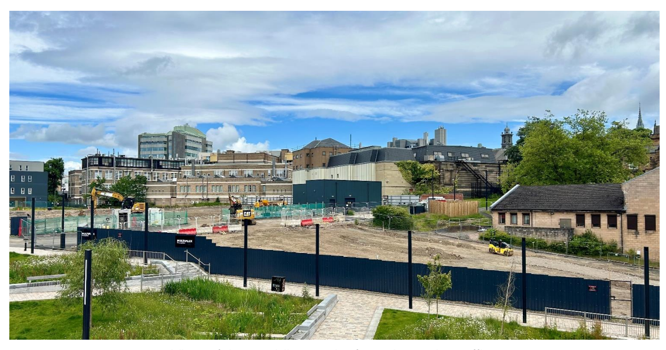
View of the enabling works from the project office