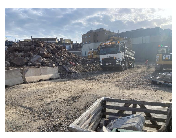
Material being removed from site