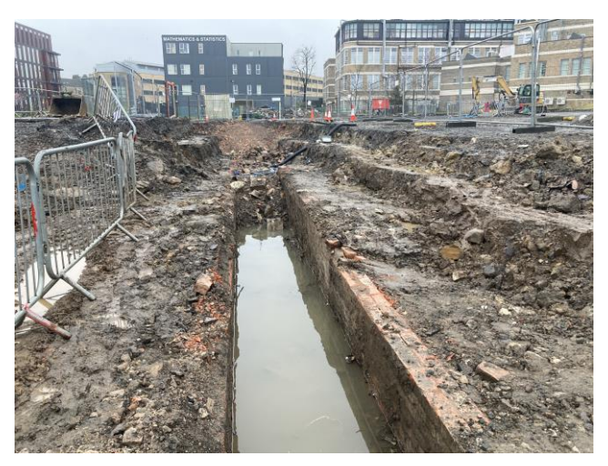
Service tunnel to be broken out